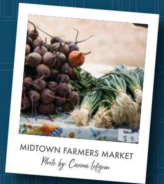
MIDTOWN FARMERS MARKET

For a traditional bowl of birria at Taqueria y Birrieria Las Cuatro Milpas (1526 E Lake St). For a modern form of birria in tacos visit Taco Taxi (1511 E Lake Street). For a trendy form of birria visit La Bodega (2829 Hennepin Ave) where you can find it topped on ramen.