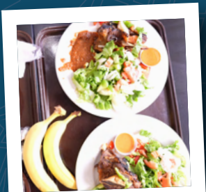
HUFAN RESTAURANT & CAFE

Find fresh produce, locally prepared foods, and more twice a week at the Midtown Farmers Market in Market Square. midtownfarmersmarket.org