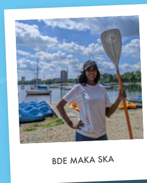
BDE MAKA SKA

Visit the Chain of Lakes Walk, roll, or stroll along the Chain of Lakes at the end of West Lake Street in Minneapolis. Better yet - get in one of the 3 lakes, Lake of the Isles , Bde Maka Ska , and Lake Harriet by renting a paddleboard or pedalboat from Wheel Fun Rentals (3000 East Bde Maka Ska Pkwy)