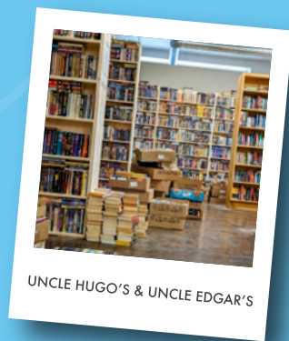
UNCLE HUGO'S & UNCLE EDGAR'S