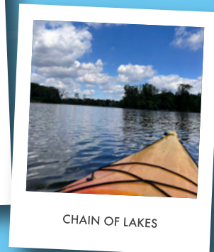
CHAIN OF LAKES