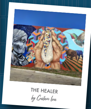
THE HEALER by Gustavo Irujo