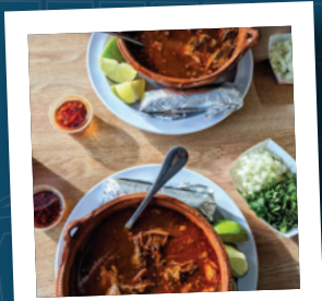
TAQUERIA LAS CUATRO MILPAS

Lake Street in Minneapolis stretches over 6 miles and is home to more than 2,000 businesses and non-profits! It's hard to know where to start.