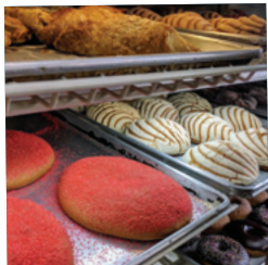
PANADERIA EL SABOR ECUATORIANO

This Lake Street bucket list activity isn't limited to when you have a sweet craving, you can find bread with mole and other savory fillings at Panaderia San Miguel (1623 E Lake St).