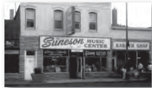
11 1611 EAST LAKE: SUNESON MUSIC CENTER