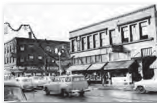
1 804 EAST LAKE: TOWN TREAT CAFÉ