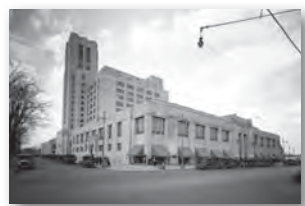
2 2843 ELLIOT AVENUE SOUTH: SEARS, ROEBUCK AND COMPANY