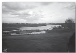
3 POWDERHORN PARK