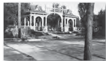
10 MINNEAPOLIS PIONEERS AND SOLDIERS MEMORIAL CEMETERY