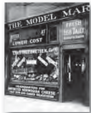
12 1601 EAST LAKE: INGEBRETSEN'S