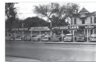
8 1800-04 EAST LAKE: CEDAR LAKE AUTO