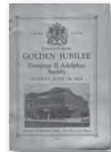
7 1628 EAST LAKE: GUSTAVUS II ADOLPHUS SOCIETY