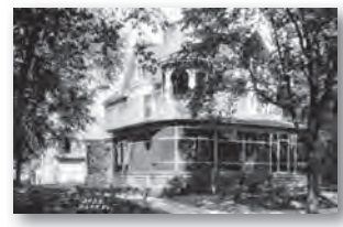
18 PARK AVENUE RESIDENTIAL DISTRICT