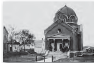
13 2947 10TH AVENUE SOUTH: ST. MARY'S GREEK ORTHODOX CHURCH