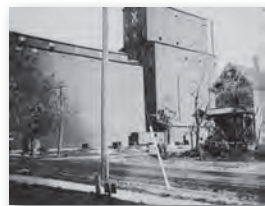
14 2845 10TH AVENUE SOUTH: ELEVATOR X