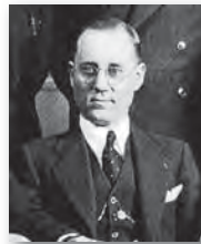
6 BLOOMINGTON AVENUE AND LAKE STREET