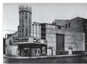
5 1500 EAST LAKE: AVALON THEATER