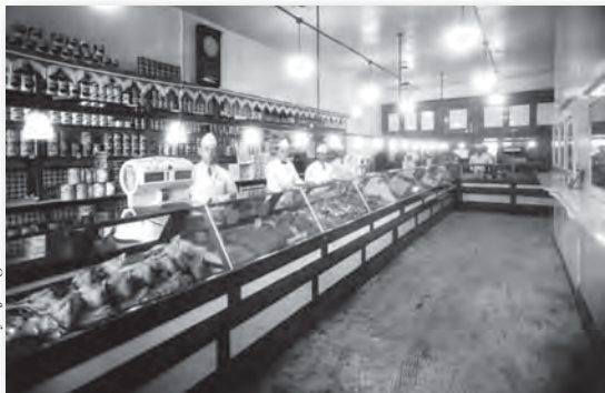
Charles Ingebretsen behind the meat counter with three employees, ca. 1925.