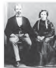
9 LAYMAN'S FARMHOUSE