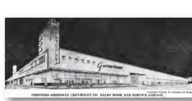
4 1304 EAST LAKE: GROSSMAN CHEVROLET